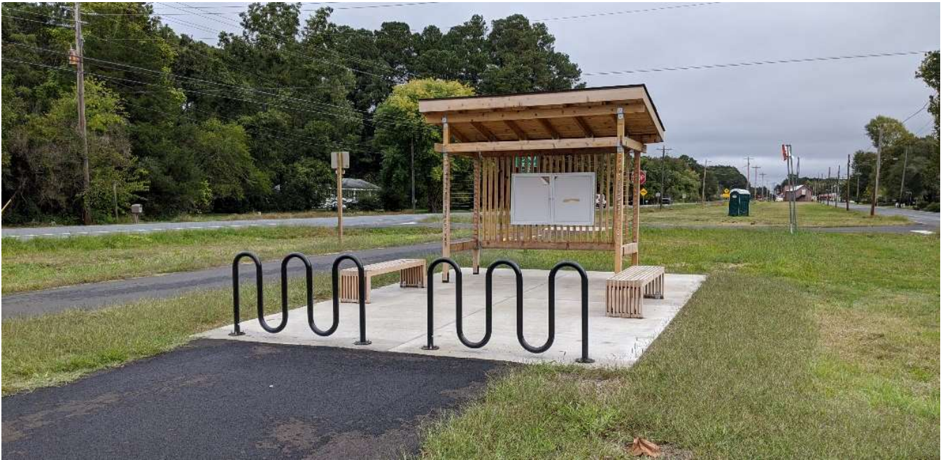
Somerset County completed the MD 413 Hiker Biker Trail construction, a 4.5 mile shared-use path between Crisfield and Marion Station