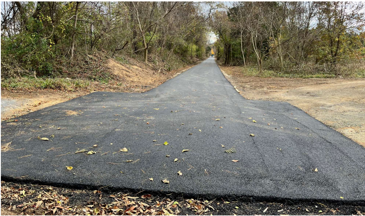
Chestertown is extending the Gilchrest Rail Trail from Morgnec Road with funding from an FY21 Bikeways award. The project is scheduled for completion in Summer 2022.