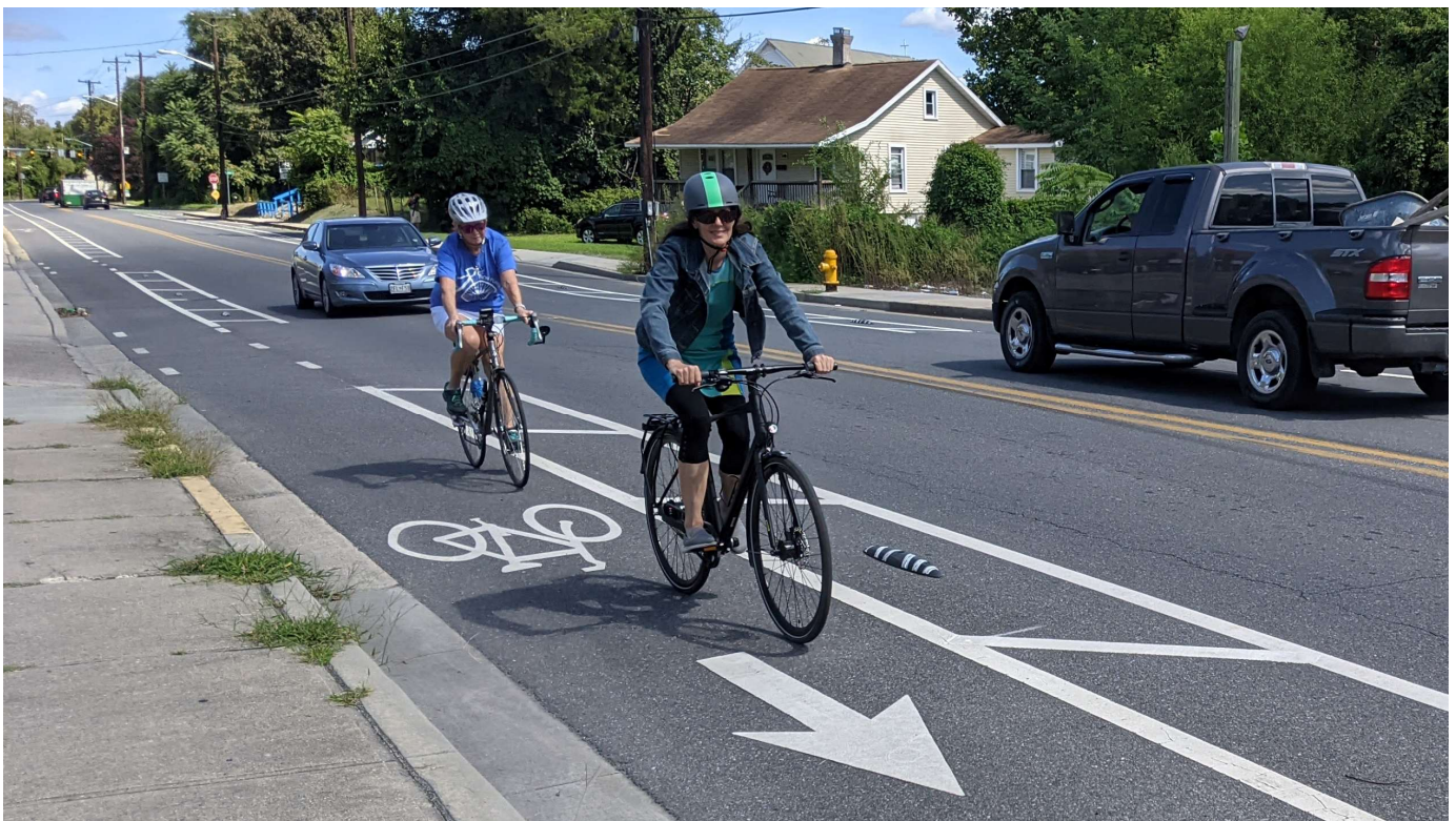
The Northwest Salisbury Bikeways, Phase 1 constructed protected bike lanes and traffic calming to Isabella Street and Lake Street

The Bikeways Program is a competitive, reimbursement-based grant program funded through the Maryland Transportation Trust Fund. The program is open to local government agencies and other eligible entities for the design and construction of transportation infrastructure to support safe bicycle travel. The Bikeways Program is not intended to be used for the creation of local bicycle master plans, but has supported a broad range of bicycle projects from feasibility studies and preliminary design to more complex construction projects, like the Anacostia River Trail. The program has been particularly successful in supporting local jurisdictions in the development of initial project design plans, to create a pipeline of prioritized projects that can attract additional funding sources, such as the Transportation Alternatives Program.