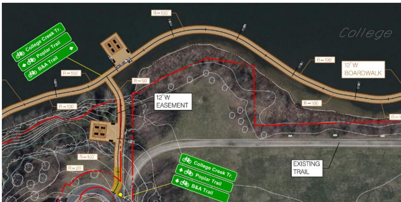
The City of Annapolis's Low-Stress Connectors project identified the College Creek Connector as a vital link between MD 450 and points across town.