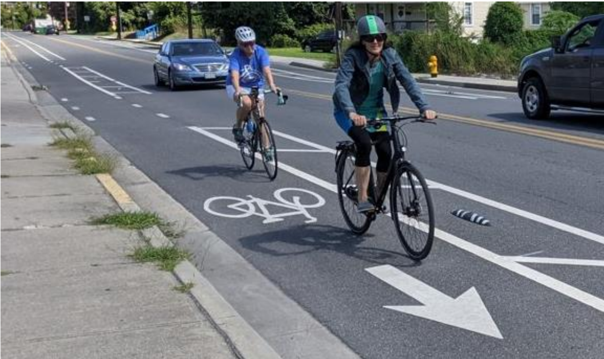
The City of Salisbury completed Phase 2B of the Northwest Salisbury Bike Network which extended the city's low-traffic-stress bike network to the underserved northwest area of the city.

The Kim Lamphier Bikeways Network Program provides grant support for a wide range of bicycle network development activities. The Program supports projects that maximize low-stress bicycle access, fill missing links in the state's bicycle network, and enhance last-mile connections to work, school, shopping, and transit. The Bikeways Program seeks to leverage past investments in bicycle facilities, complement existing state, local, and federal programs, and promote biking as a fun, healthy, and safe transportation mode.