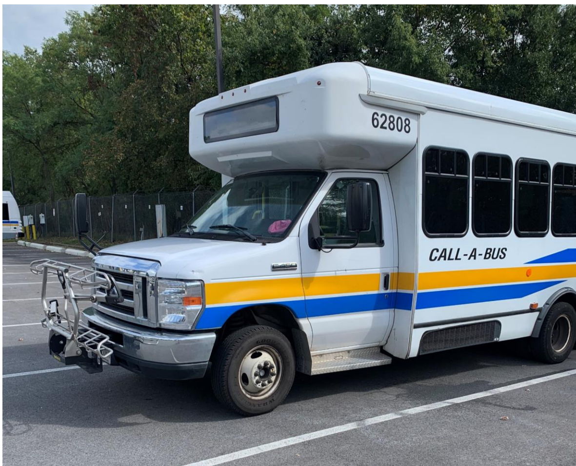
Prince George's County installed bike racks on former paratransit vehicles to be used in the county's microtransit system centered around National Harbor and Fort Washington.

*Award totals represent the amount reimbursed for the project. Award totals may differ from awarded amounts when projects are completed under budget.